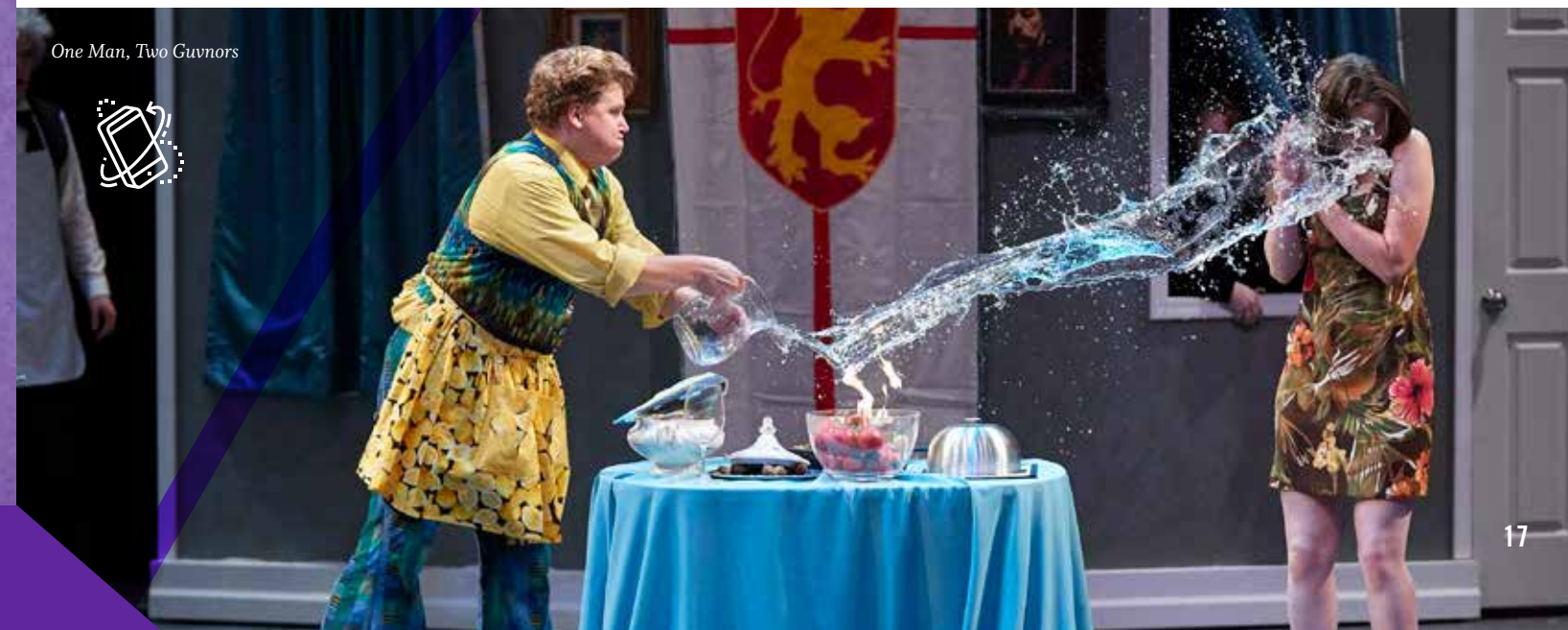
One Man, Two Guvnors