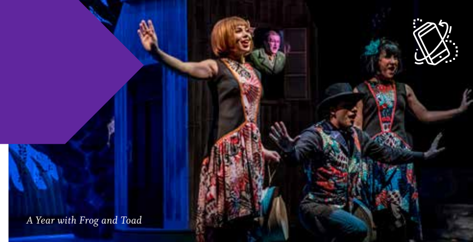
A Year with Frog and Toad