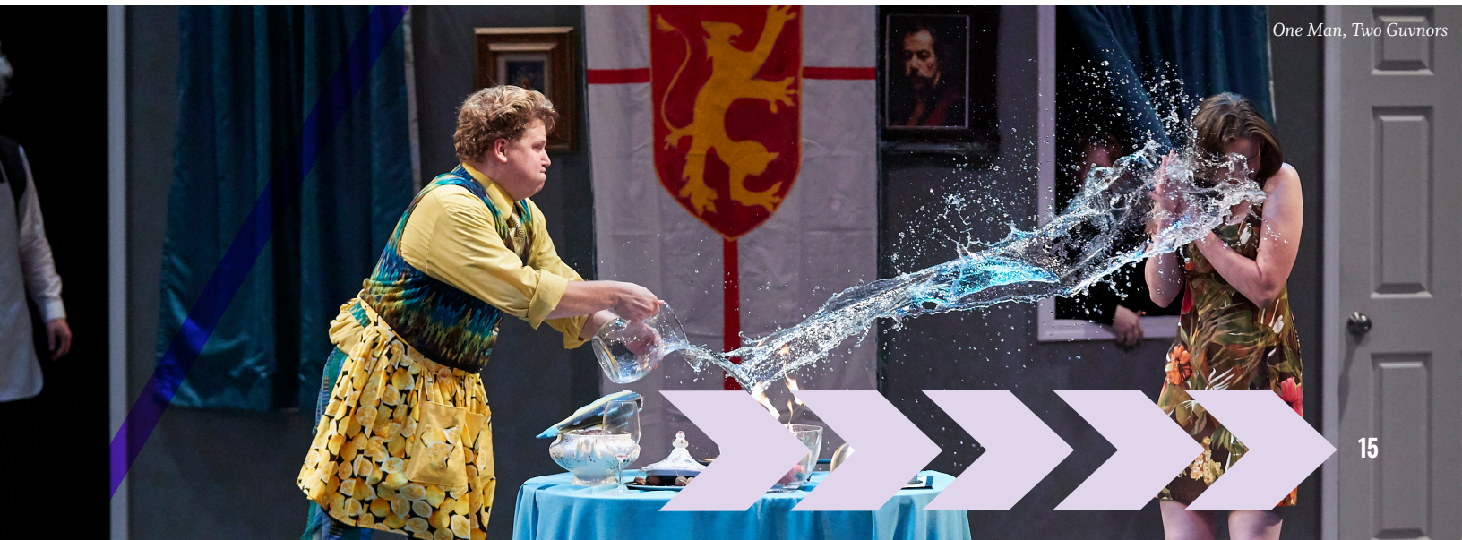
One Man, Two Guvnors