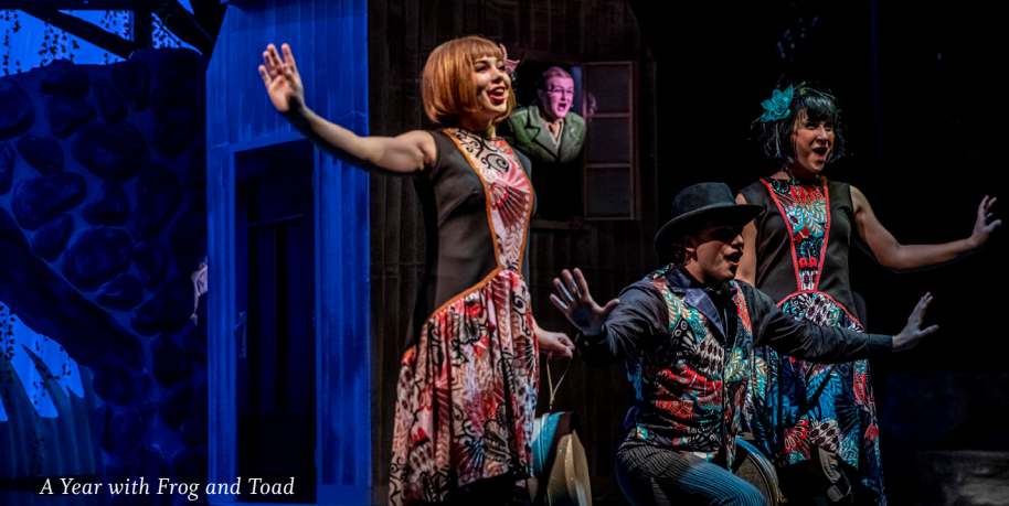
A Year with Frog and Toad