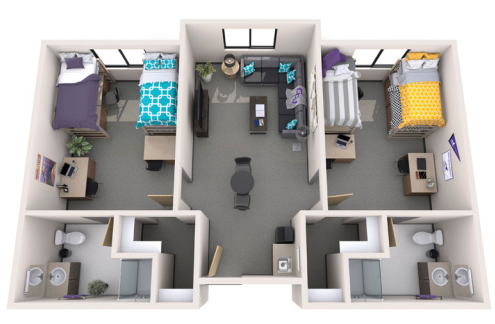
Triple Occupancy (shared by six students)

Double Occupancy (shared by four students)