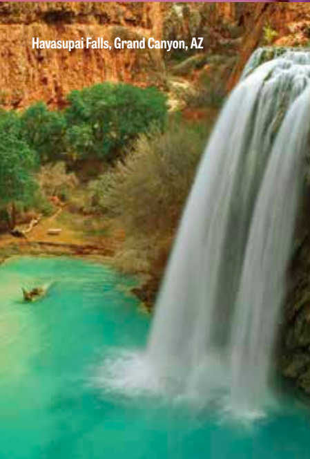
Havasupai Falls, Grand Canyon, AZ