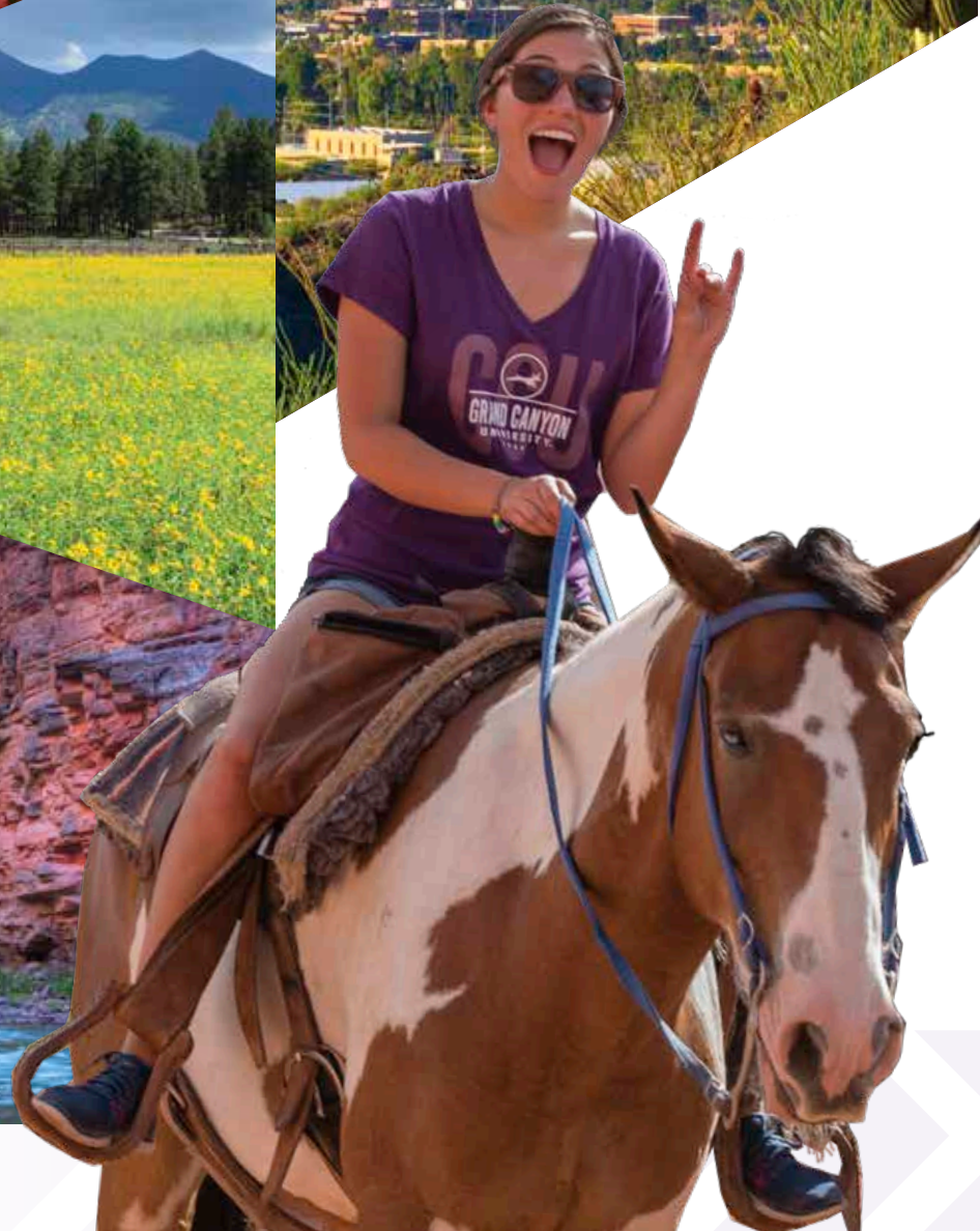
Grand Canyon National Park, AZ