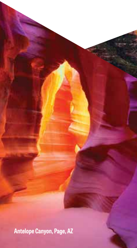
Antelope Canyon, Page, AZ

For both Arizona natives and visitors, the Grand Canyon state and city of Phoenix will always amaze and offer something new to discover. Our sunsets are beautiful. The Sonoran Desert is a natural playground for hiking, biking and camping. Towns from Sedona to Flagstaff are home to distinctive natural beauty and unique things to do.