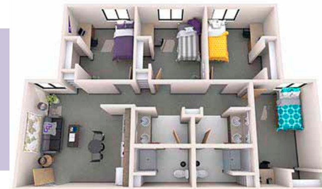
Apartment Style (shared by 4 students)