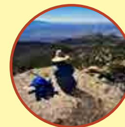
Saguaro National Park East Tanque Verde Ridge Trail