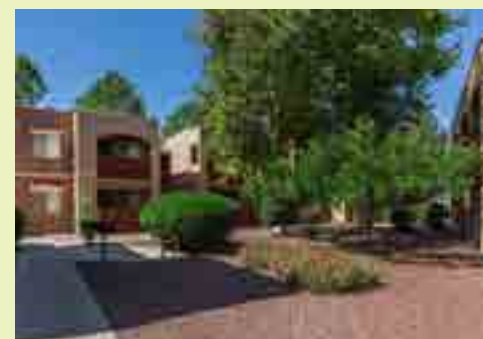
College Town Apartments