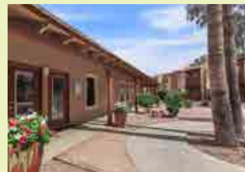
Fox Point Apartments