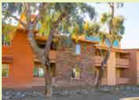
Casa Presidio Apartments