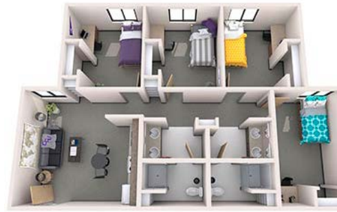
Single Occupancy (shared by four students)