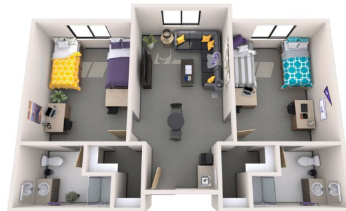
Double Occupancy (shared by four students)