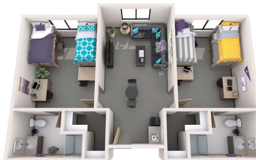
Triple Occupancy (shared by six students)