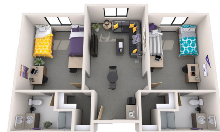
Double Occupancy (shared by four students)