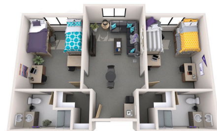
Triple Occupancy (shared by six students)

Housing and food rates start at just $3,800 per semester. 1