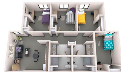
Single Occupancy Apartment (shared by four students)