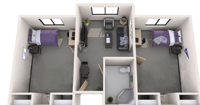
Single Occupancy (shared by two students)